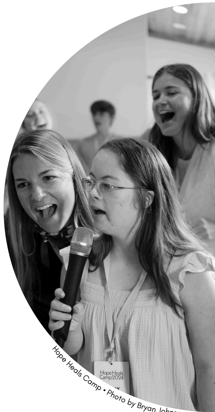
Hope Heals Camp

The next page illustrates this new way to think about identity—one grounded not in ability or appearance, but in belovedness and belonging.